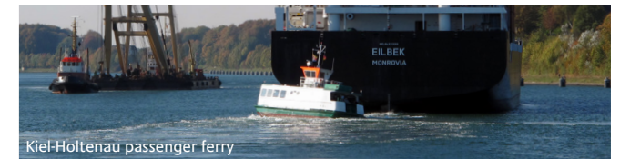
Kiel-Holtenau passenger ferry

Kiel-Wik on the south side of the canal and Kiel-Holtenau on its north side are connected by a passenger ferry. Take advantage of this free service, and feel free to take along your bike! On board the ferry, you will have an excellent view of the lock operations and cross the path of the incoming and outgoing vessels on your way from one bank of the canal to the other.