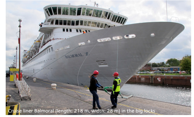
Cruise liner Balmoral (length: 218 m, width: 28 m) in the big locks